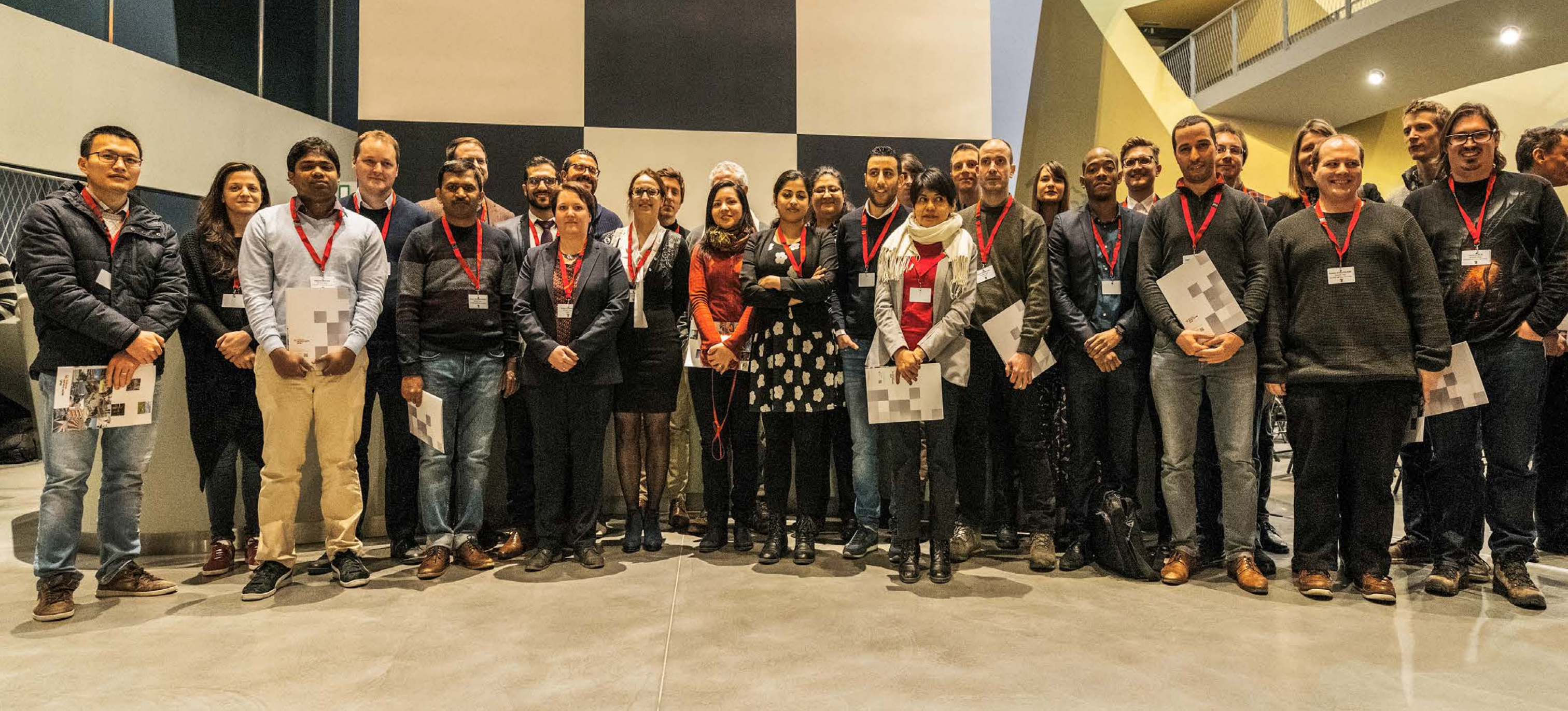
A part of the 85 researchers was present at the Musée Hergé